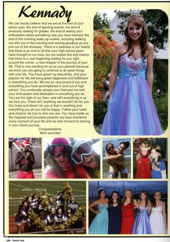
286 Senior Ads